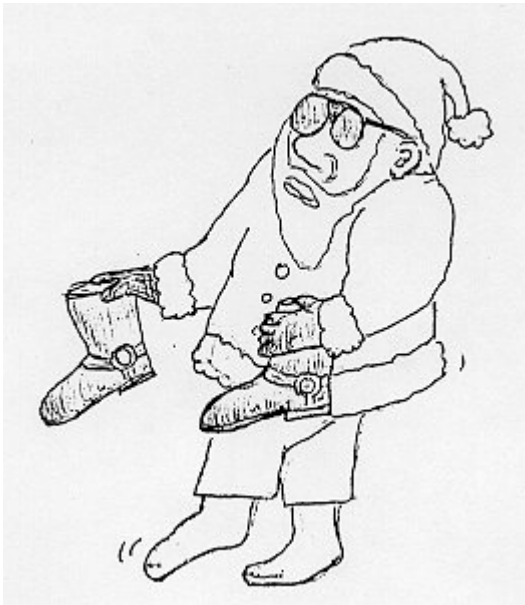
Christmas sort of snuck by me this year ...

After many occasions this year that we wished to send a special thank you note with a cute original illustration for a special occasion, a good time or a considerate act, our good intentions did not come to fruition [we never got around to it]. To all those who deserve thanks in this category, please accept our sincere appreciation for whatever it was that put us in your debt.