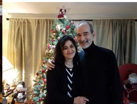
Philly, Rome Wine Forum; Ponza,Vatican; Tevere, Venice; Crati aperitivo, Villanova dressup, holiday photo

Our annual news and more/better photo viewing is online at our website!