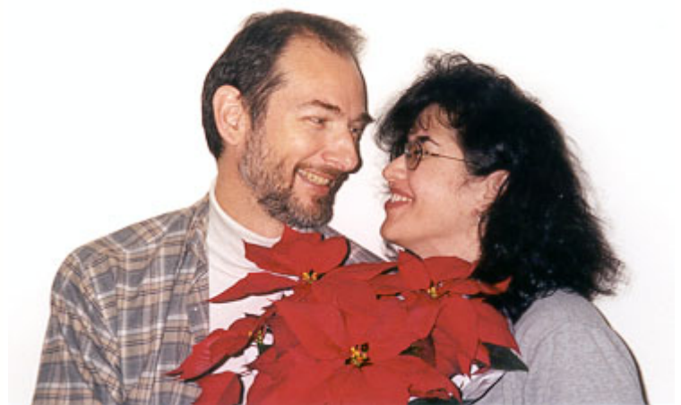
drbobenterprises.com losing money like the worst of the dot coms but still smiling

in memory of the women of afghanistan and Iraqi civilians who will not make the real 3rd millenium